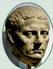
De vita Caesarum [The Twelve Caesars] (121) Suetonius