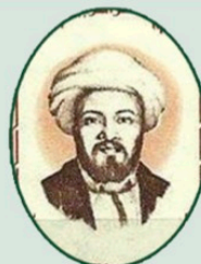
'Ajā'ib al-Āthār fī 'l-Tarājim wa-'l-Akhbār [History of Egypt] (1805-1821) Abd al-Rahman al-Jabarti