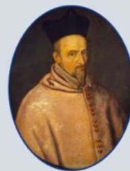
Histories of Scotland (1578) John Leslie