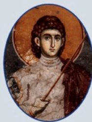
History of the Wars (545-553) Procopius of Caesarea