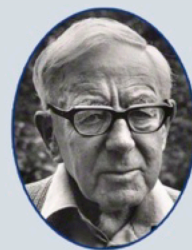
English History 1914-1945 (1965) A.J.P. Taylor