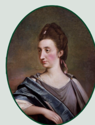
The History of England from the Accession of James I to that of the Brunswick Line (1763-1783) Catherine Macaulay