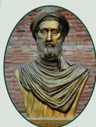
Muqaddimah (1377) Ibn Khaldun