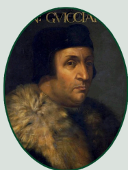
History of Italy (1537-1540) Francesco Guicciardini