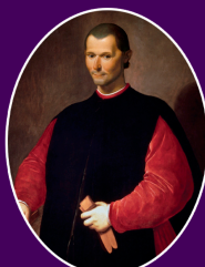
Florentine Histories Niccolò Machiavelli