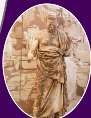
Parallel Lives Plutarch