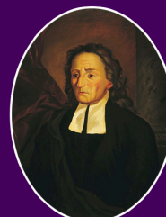
The New Science Giambattista Vico