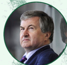
RICHARD J. EVANS

2pm Seminar “ The Age of Revolution ”, “ The Age of Capital ” and “ The Age of Empire ” by Eric Hobsbawm