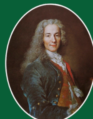
Le Siècle de Louis XIV Voltaire