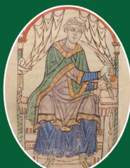
Historia novorum in Anglia Eadmer